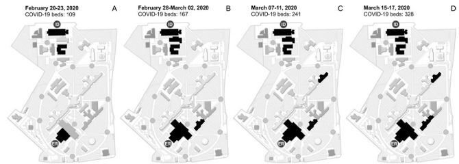
Figure 1 Reorganisation at Luigi Sacco University Hospital (LSUH) to increase the number of COVID-19 dedicated beds and wards (in black) during the the first weeks of the epidemic in Lombardy. ER, emergency room; ID, infectious diseases department.

This cohort study evaluated the dynamics of SARS-CoV-2 seroprevalence among the hospital's HCWs between 21 February and 27 May 2020. All of the hospital personnel (696 nurses, 346 doctors, 205 health service assistants including cleaners, 188 administrative staff and 115 healthcare technicians) were invited to participate in the 3-month serological survey on a voluntary